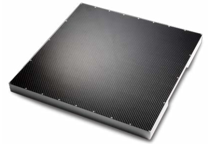
Configuration Detector FXRD-17175A/B Power Supply Unit FXRP-01 Designed and manufactured by Vieworks in Korea