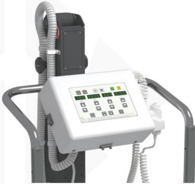
1 Region APR Console MEMBRANE