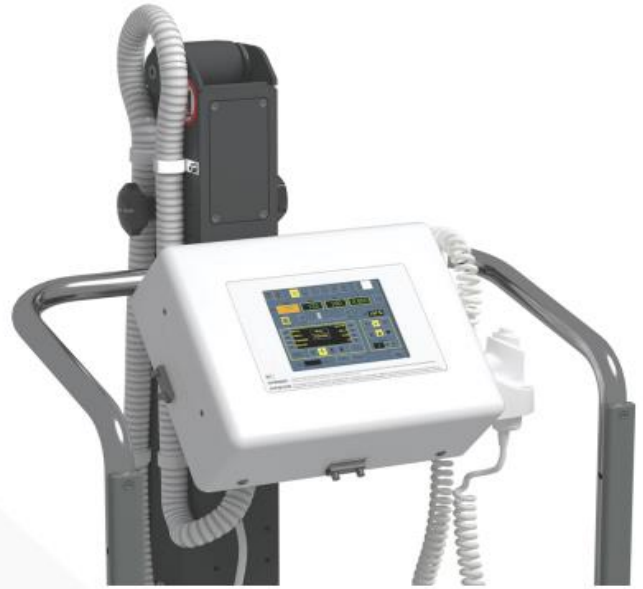
6 Region APR Console TOUCHSCREEN